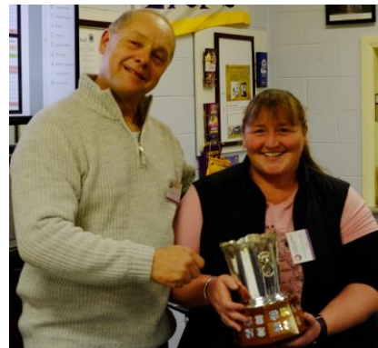
Two winners here