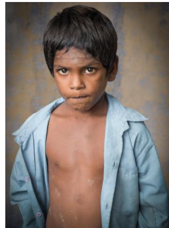
Highly Commended: What are you looking at? by Trevor Bunyard