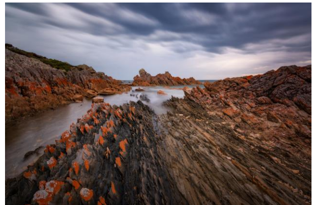
Colours of the Cape