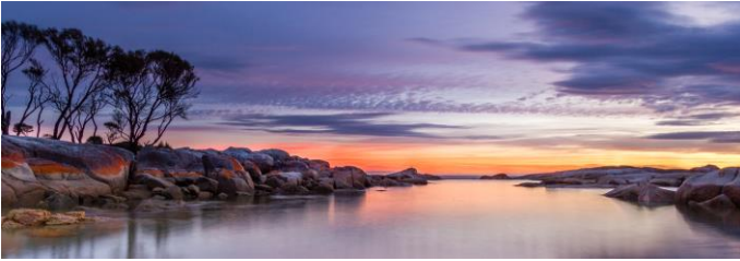
Second place: Binalong Bay by Robyn Whishaw