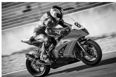
Racing to the top by Sue Saunders