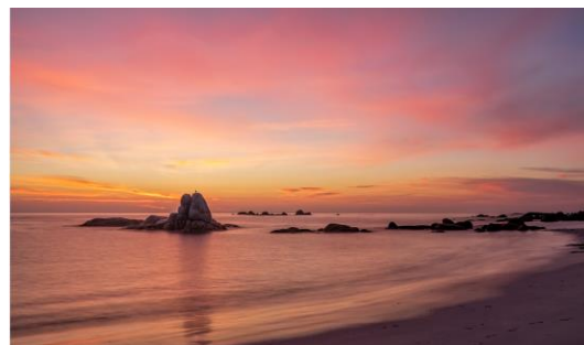
Highly Commended: Deep Creek Dawn