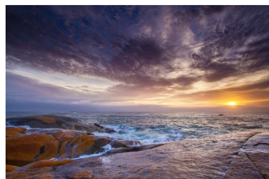
Highly Commended: Binalong Bay Sunrise By Robyn Wishaw