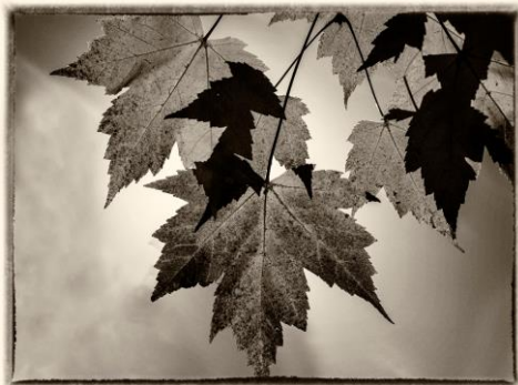
Sonya Byrne: Shadow Leaves