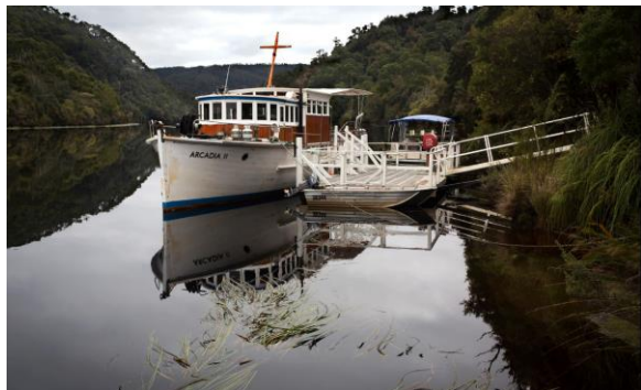
Photo of the Arcadia on the Pieman River

Nine members are travelling to Corinna on Friday 26 th October to stay at Corinna Wilderness Experience in the pristine environment of the Pieman River. These intrepid tourists have also booked on an early morning cruise on Saturday morning to the mouth of the Pieman River. Accommodation is still available. Contact Pieman Wilderness Experience to book.