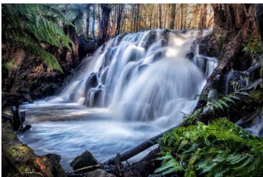
Highly Commended: Upper Cam Afternoon by Fiona Carter