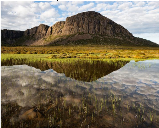
Consummate Tasmanian Landscape Photography by Cam Blake

For September 11 th (next Tuesday night): Guest Speaker is Cam Blake