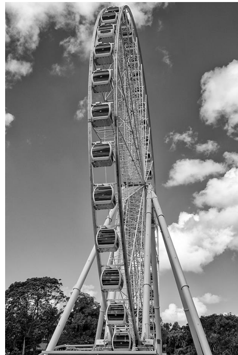
Highly Commended: The Wheel by Sonya Byrne