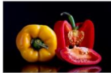
Capsicum