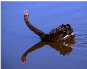
R Oliver – Black Swan.jpg