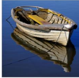
2nd Place – Dinghy Rod Oliver