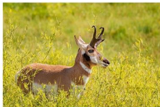
S Whitworth – Pronghorn.jpg