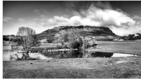
3rd Place – Mount Roland Morning Fiona Carter