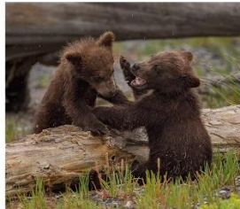
F Staub – Bear Cubs at Play 759.jpg