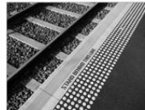
Train Tracks Robyn Whishaw