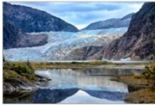
Mendenhall Glacier Fiona Carter