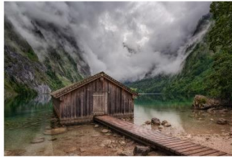
S Whitworth – Obersee Boatshed.jpg