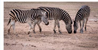
P Routley – Zebras Wildlife.jpg