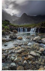
L Fairfax – Moody Skye.jpg