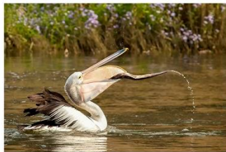
F Carter – Lunch.jpg