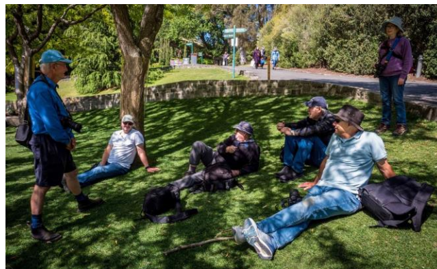
Taking five minutes' rest at Wordsearch