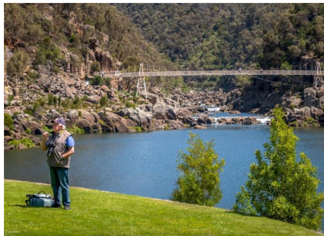
Tom Astbury searching for something beginning with "B" Clue: "Always look behind you!"