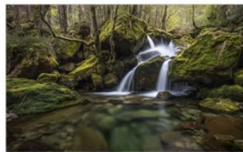
Highly Commended – Louise Fairfax Forest Calm