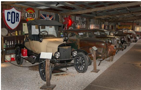
Herberton Historic Village, Nth Q'ld By Sonya Byrne