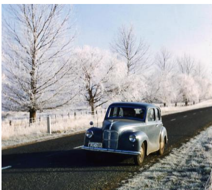
Our old Austin A40 on a frosty morning, Midlands Highway, 1960s