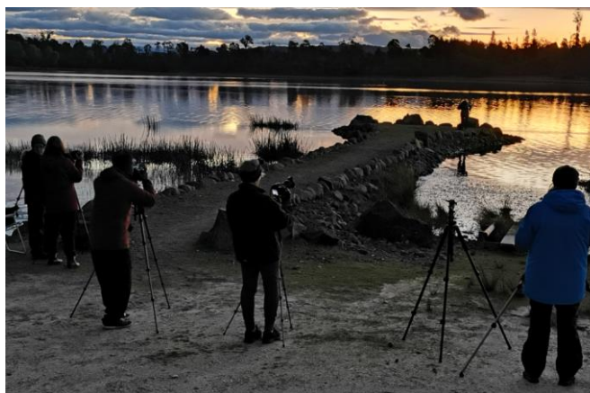
Members treated to an impressive sunset before dark

Twenty-eight members assembled on the bank of Four Springs Lake near Hagley on Saturday 10 th October, an excellent turn out of half the members in the club. Before the sky darkened, members were treated to an interesting sunset with the edges of the clouds illuminated and coloured red. Members positioned themselves on the water's edge across the car park for the night shoot