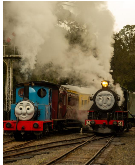
The only way to travel by Ron Camplin