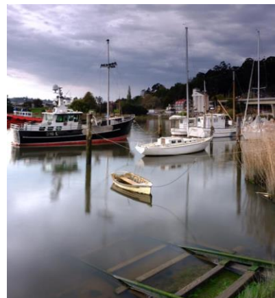
Tamar Yacht Basin