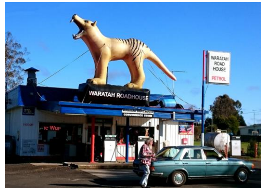
Waratah Road House by Rod Oliver