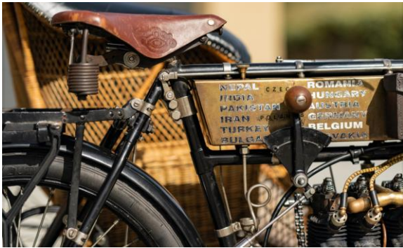
A very early motorbike by Sue Saunders