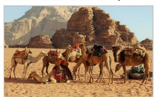
FIRST PLACE MURIEL ROLLINS 'Wadi Rum Sojourn'