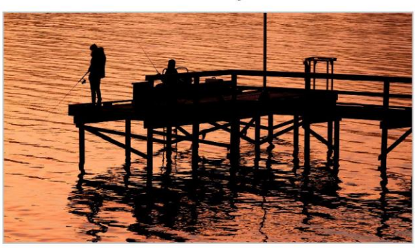
HIGHLY COMMENDED ROD OLIVER 'Sunrise Fishing'