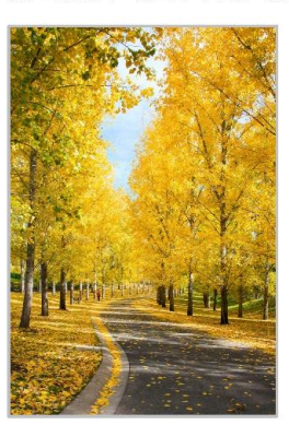
HIGHLY COMMENDED WENDY GEDDES 'Autumn in Lilydale'