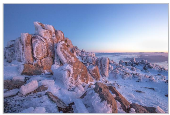
THIRD PLACE ROBYN WHISHAW 'Sunrise Finders Island'