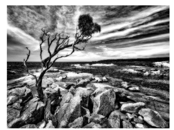
In THIRD PLACE, achieving 106 Points - SARA BARRITT