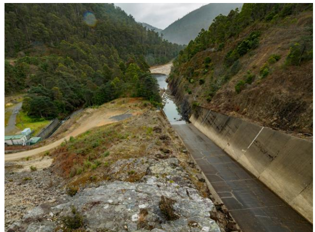
Spillway at dam at Arm River Bridge