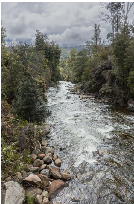
Mersey River