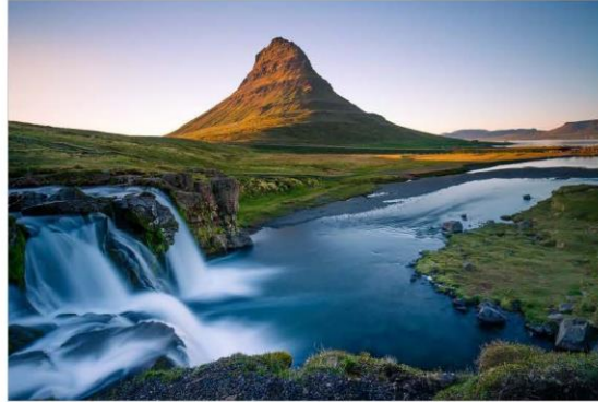
2nd Place – Louise Fairfax Midnight