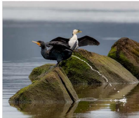
Steve Whitworth - Great Cormorant Ignition Sequence