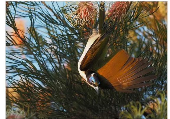
Wendy Geddes - Blue Faced Honey Eater