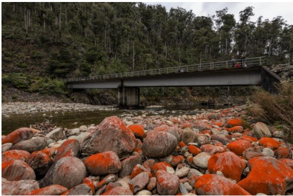
Arm River Bridge