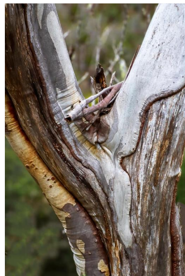
Eucalypt tree trunk.

Next Club Meeting at Lions Club: Tues 13 th December at 7.00pm Bring a plate of finger food, plus mug for tea or coffee.