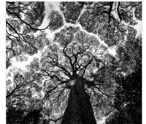
Steve Whitworth - High in the Canopy