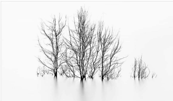
Neal Albrey - All That Remains