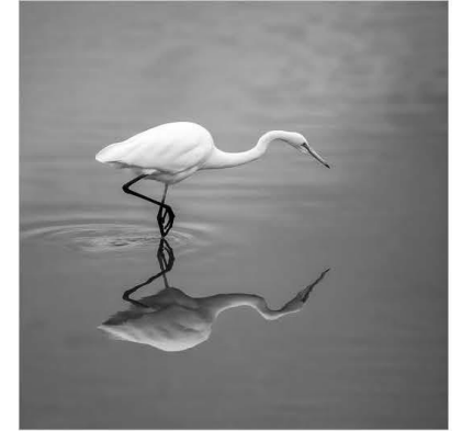
Fiona Carter - Great Egret Reflection