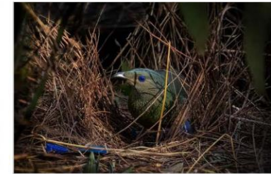
HC – Fiona Carter Building the Bower