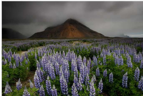
Louise Fairfax - Lupin Field