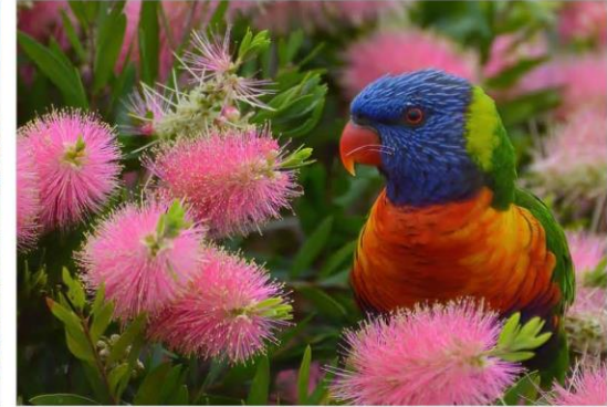
3rd Place – Sue Griffiths Tasty Bottlebrush