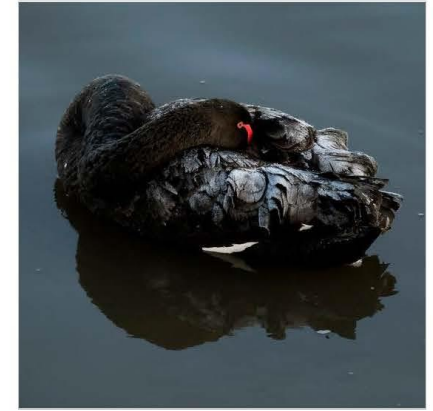
Rod Oliver - Frosted Swan