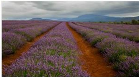
Ruth Timperon Bridestowe 202