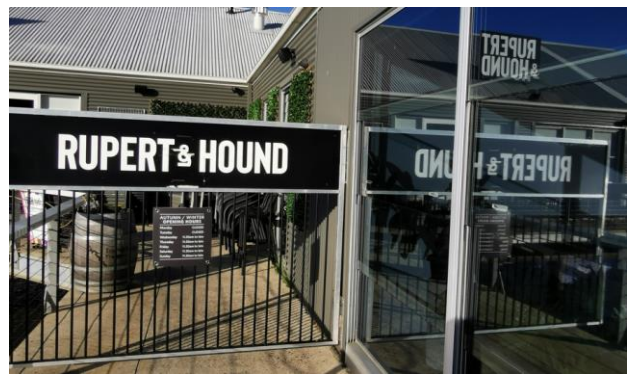
Reflection of the glass at Rupert and Hound Restaurant at Seaport