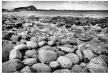
Fiona Carter Pebble Beach