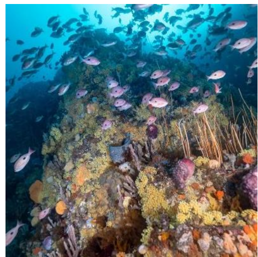
Trident Reef near Port Arthur