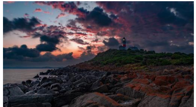
Another "moody" image by Muriel Rollins