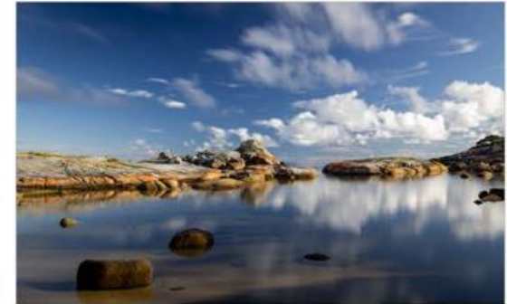
3rd Place – Robyn Wishaw – Binalong Bay