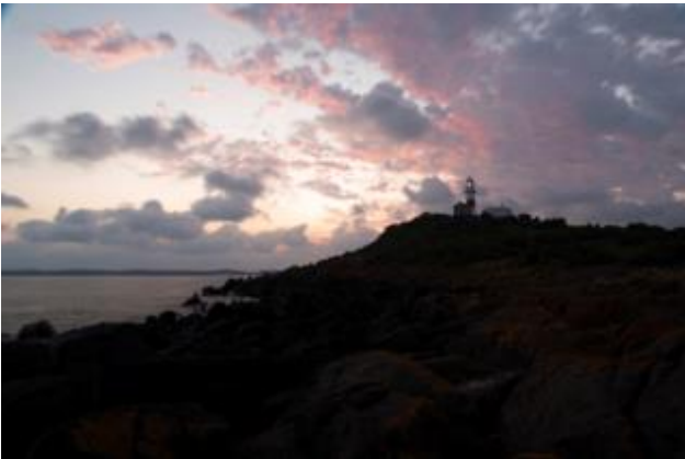
The original RAW file

The captured image settings were as follows: FL 25mm / Aperture f/22 / Exposure 8 secs / ISO 50. The image had a wide dynamic range from shadows through to highlights but was exposed for the highlights. Plenty of detail was available in the shadows that could be drawn out during post processing. Here are some of the edits that were submitted to the challenge: