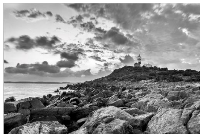
A nice monochrome edit by Neil Albrey