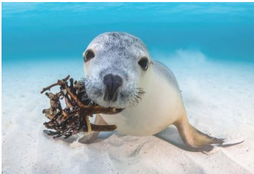
Australian Seal Lion