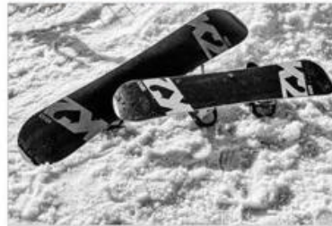
Sonya Byrne K2