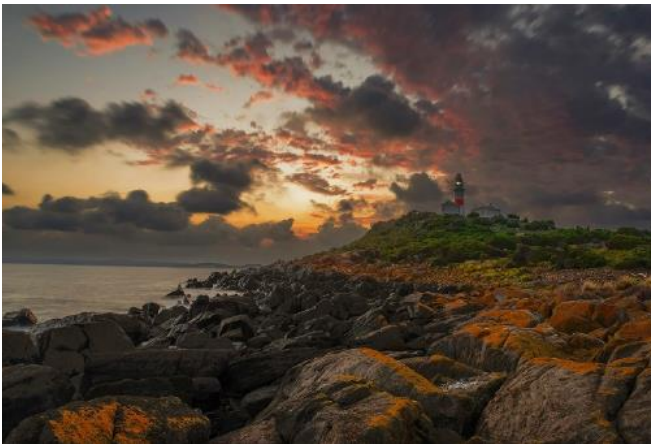
A "moody" colour image by Ian Douglas