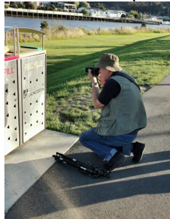
Donn Corcoran photographing the recycling bin.