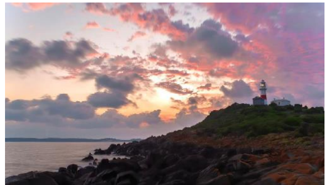
A nicely balanced image