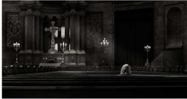
1* Place – Rob Beattie – Alone Time