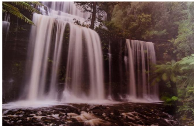
Russell Falls at Mt Field