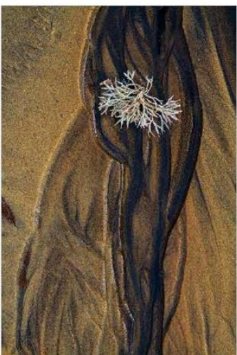
Second Place 'Beach Patterns' by Ruth Timperon