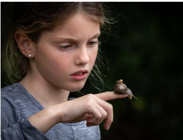
"2 little snails" by Sara Barritt