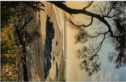
'Morning Stroll' Joanne Beswick