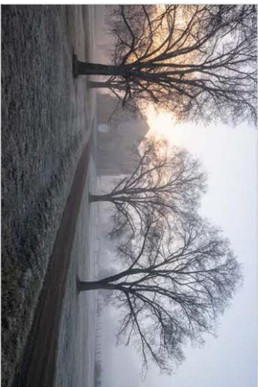
Second Place 'Off to Church' by Louise Fairfax