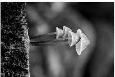
'Under dads protection' By Louise Fairfax