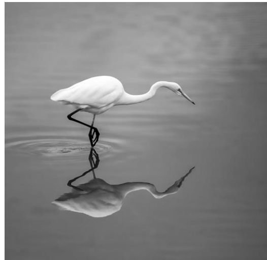
"Great Egret Reflection" by Fiona Carter