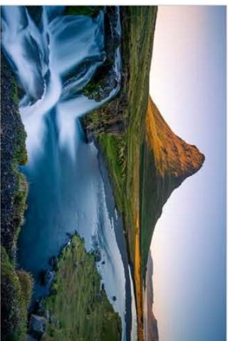
'Midnight' by Louise Fairfax