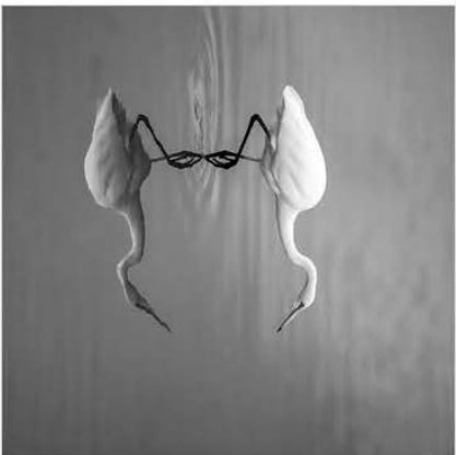
First Place 'Great Egret Reflection' by Fiona Carter