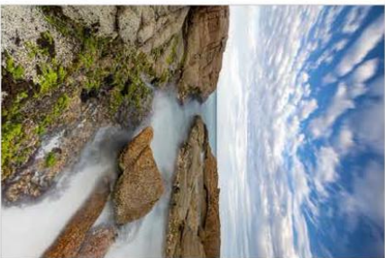
'East Coast Seascape' Robyn Whishaw